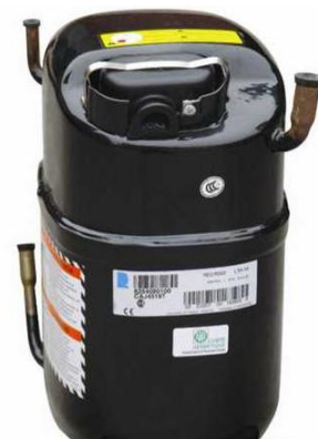
France Tecumseh compressor